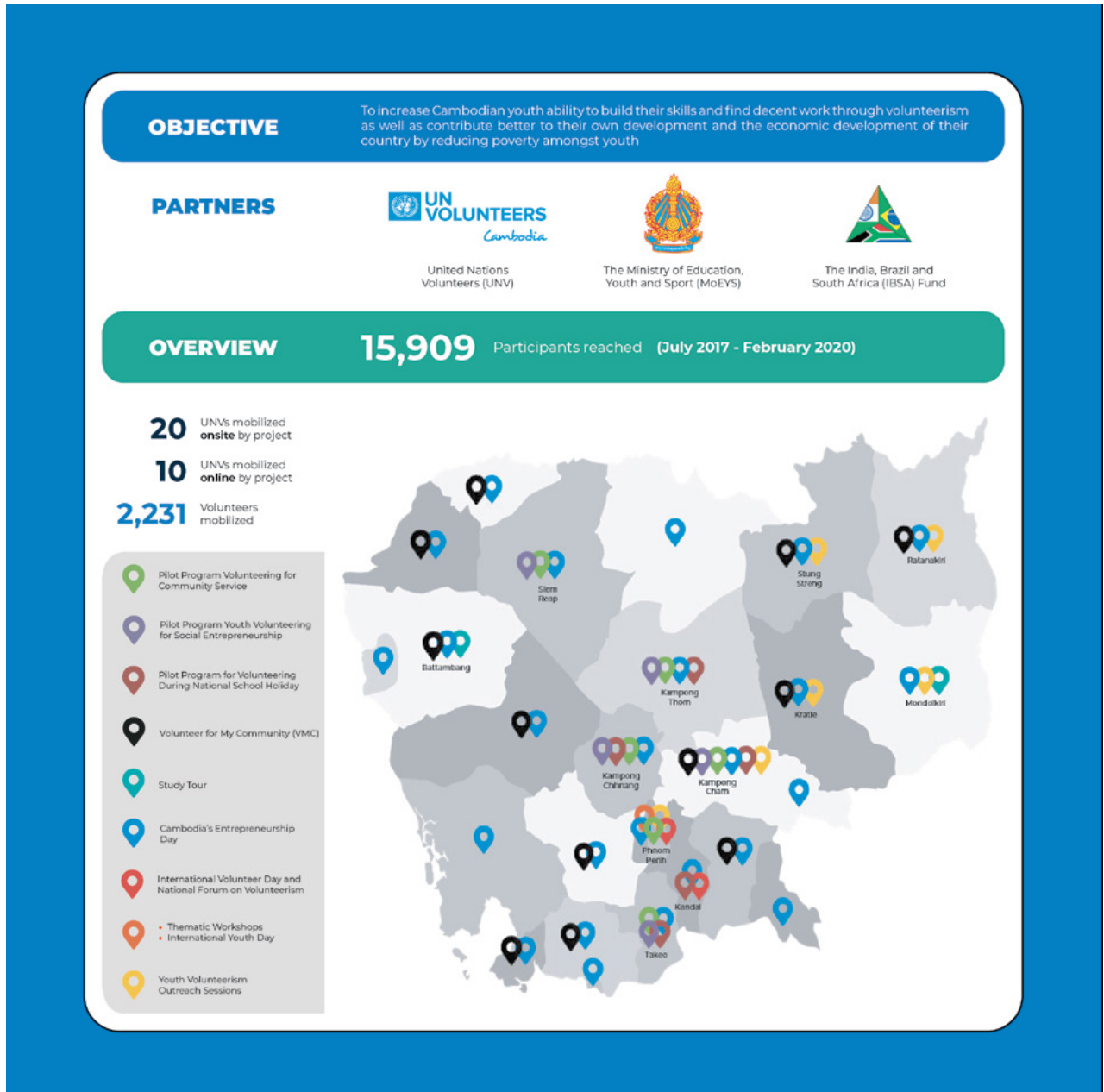
Figure 1: Reach of the Youth Volunteers Skills Development, IBSA Project, Cambodia.

Thus, a South-South cooperation development fund provided the capital that supported the robust development of a national volunteer policy and a youth volunteering scheme in Cambodia. Furthermore, triangular cooperation through which UNV facilitated a South-South exchange between youth volunteers in Cambodia and India as part of this project led to knowledge exchange on volunteer infrastructure between Cambodia and India.