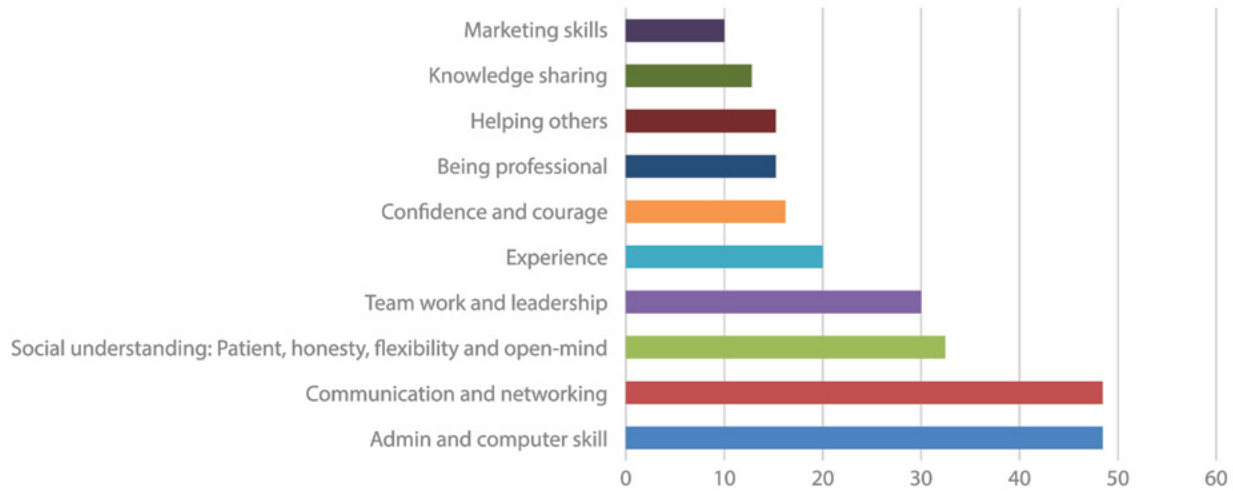
Figure 2: Skills youth reported they gained during their volunteer assignments and that they now apply in their jobs.

The project also increased awareness of and support for volunteerism in Cambodia. Recruiting volunteers and finding placements for volunteers became progressively easier as concrete benefits from the project for the volunteers and the communities and organizations in which they worked became apparent. 40