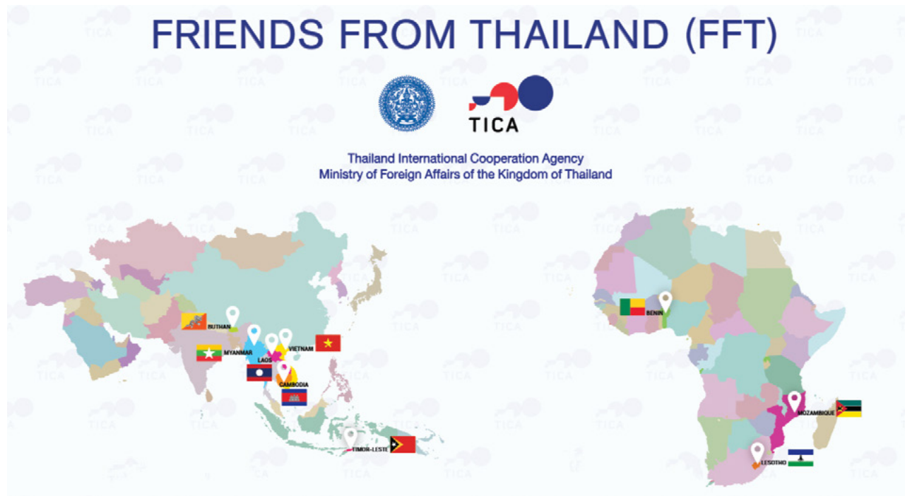
Figure 1: Reach of the Friends from Thailand Programme.