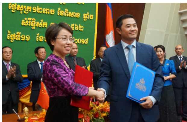
China & Cambodia VIOs sign MOU in 2018