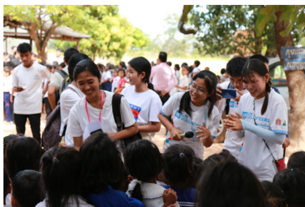
Volunteer activities in Oddar Meanchey, Cambodia

was that the volunteers' accreditation was recognized in applications for higher education and by employers as work experience. A similar approach could help support Cambodia's youth development strategies by providing a formal framework for linking skills development through volunteering to employment and higher education. Discussions and sharing of experiences have continued, for example, at a workshop held in conjunction with International Volunteer Day in 2019 and at the India Volunteering Conclave 2019. 41