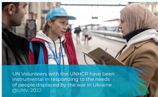
UN Volunteers with the UNHCR have been instrumental in responding to the needs of people displaced by the war in Ukraine. @UNV, 2022