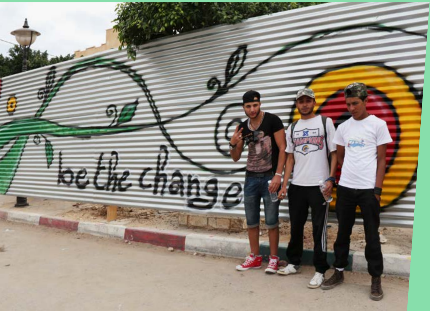
Be the change is the message young volunteers in Tunisia want to convey. This mural painting was one of the activities organized during a two week volunteering caravan across Tunisia.

Recognizing the enormous potential of young people to contribute positively to their societies, United Nations Secretary-General Ban Ki-Moon, in his Five-Year Action Agenda (2012-2016), announced a specific measure to “create a UN youth volunteers programme under the umbrella of UN Volunteers.” In response, in 2012 UNV launched a new Youth Volunteering Strategy and a UNDP/UNV Youth Trust Fund to further engage in global advocacy and partnerships for youth volunteerism and strengthen the capacity of nationally- and regionally-owned youth volunteer schemes.