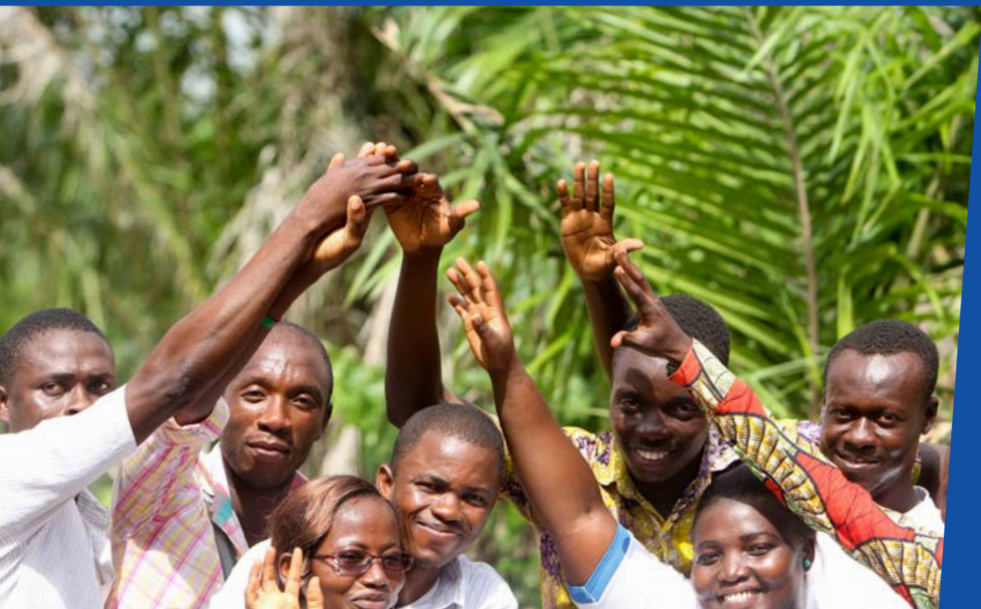
Village de Todo, Togo, (Nicolas Robert, 2014)

In 2012, 12 percent (US $1,111,000) of UNV-administered funds were spent on national capacity development through volunteer schemes in eight countries. This experience has led to a growing demand from United Nations Member States for UNV to support the establishment of national volunteer schemes to address development challenges.