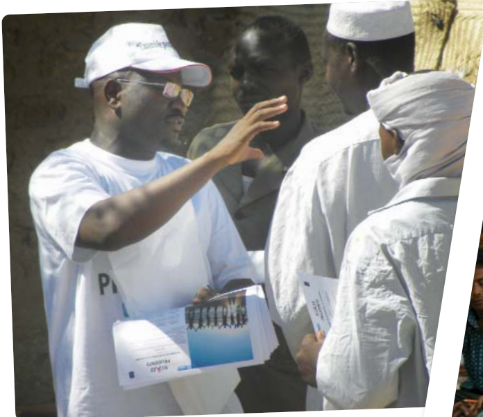
A local volunteer (left) discusses HIV/AIDS with a community member in Abeche, Chad during the 'Soyez Prudents' campaign.