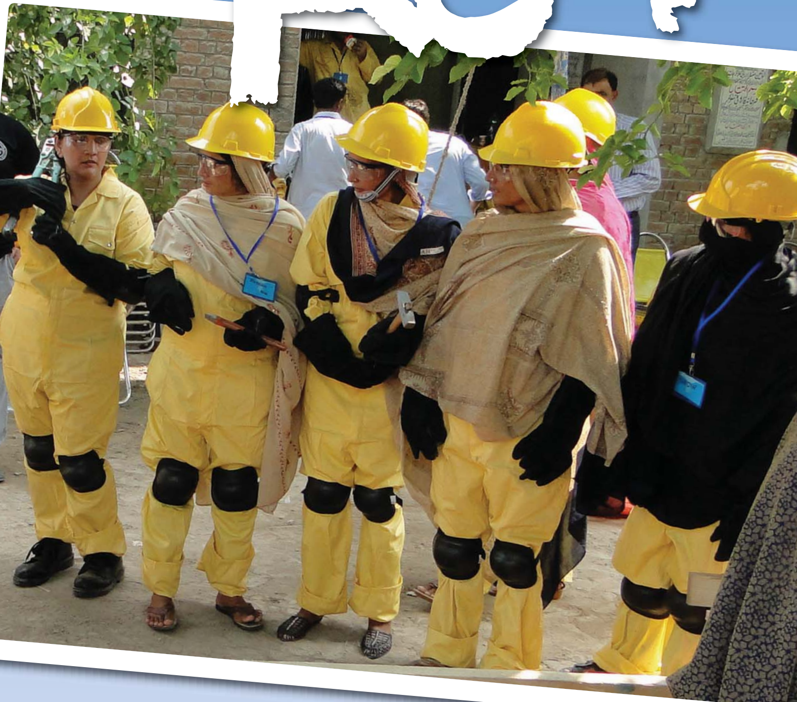
Young women in Pakistan mobilize during training of rapid response volunteers in Athara Hazari. UNV supported the District Disaster Management Authority in response to the floods.